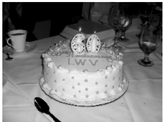
Happy 60th Anniversary, Bay Chapter!

Thursday, April 2: The Renaissance of Northeast Ohio Region – an overview.