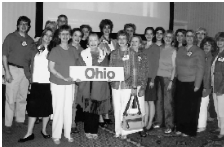
The Ohio delegation to the 2008 LWVUS Annual Convention, "Reaching New Heights Together," held June 13-17 in Portland, Oregon.

We'd prefer scheduling the next Book Club on the west side, so please let us know if you are interested in hosting.